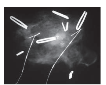
Surgical clips on breast specimen radiograph

Varying methods for communicating margin orientation require detailed explanation of marking method and time-intensive interpretation in radiology and pathology, potentially increasing the chance of communication errors.<sup>1</sup>